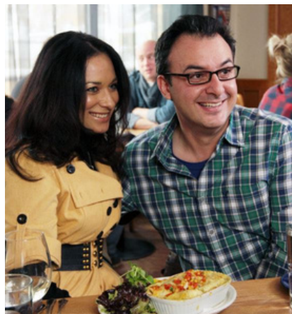
You Gotta Eat Here! (2013) Season 2, Episode 23 with John Catucci

Here are some of the notable guests that have featured or visited us over the years.