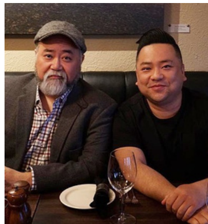
Canadian Actors Paul Sun-Hyung Lee & Andrew Phung